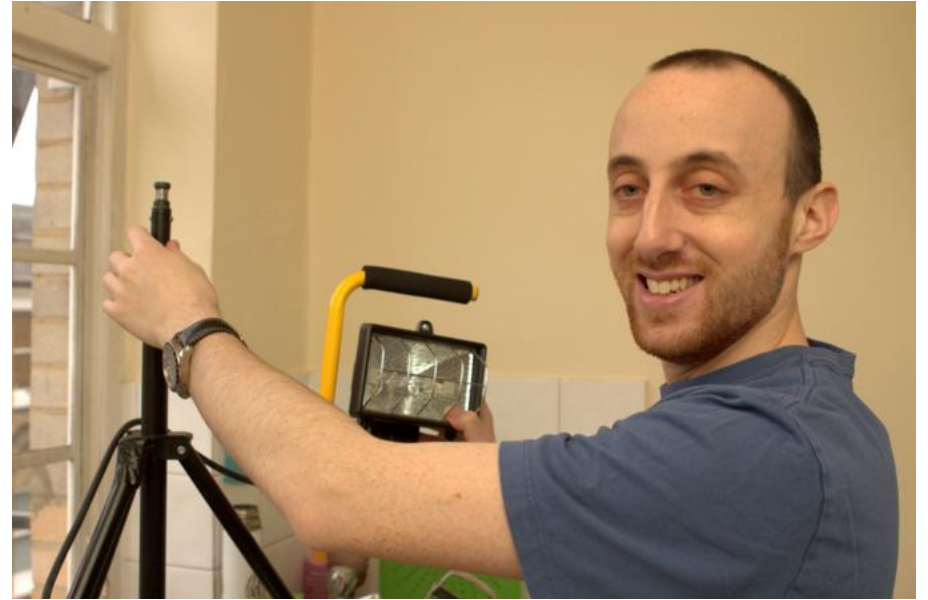
Creating the illusion of the 'moonlit apartment'.